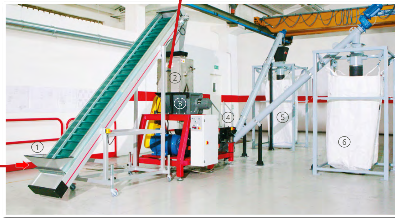
Buffing dust processing system